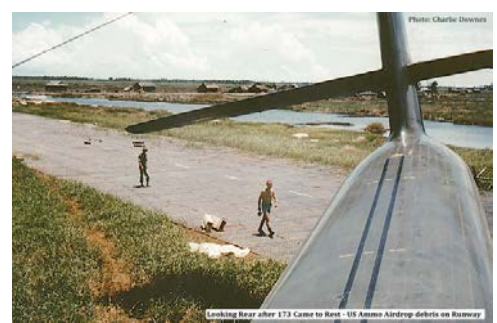
Looking rear towards runway US air drop ammo box debris still on runway Right U/C skid marks off runway

An initial assessment of the aircraft indicated that it would have to be written off and reduced to spare parts as a replacement right wing was not available. Work commenced to break the aircraft down to spares. In the main, the removed equipment included radios, instruments and electrical items. Most wiring looms were cut rather than disconnected as there was a perceived need to "get in and get out".