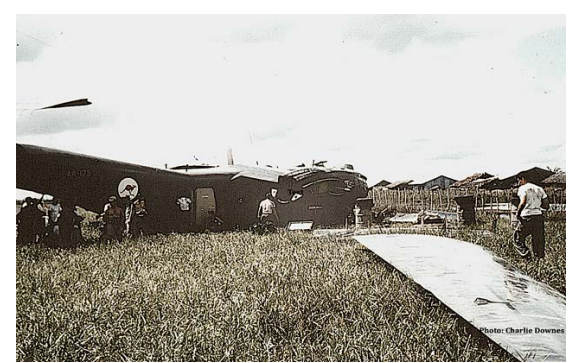
Right wing removed

There were also some US Army technicians, who mainly worked on the airframe, but helped other trades when needed. Their assistance was certainly appreciated.