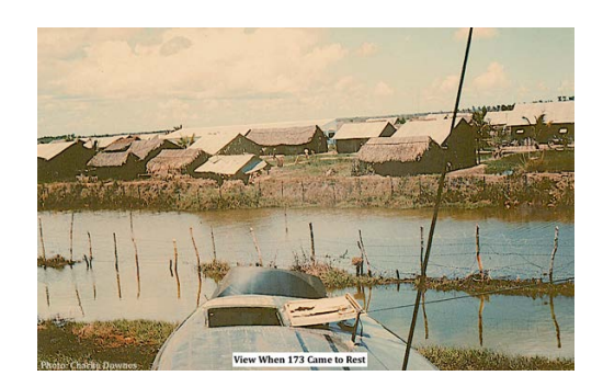
View after aircraft skidded to stop