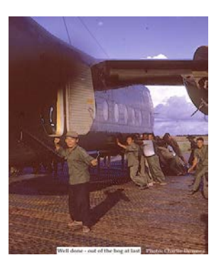
All hands needed to get it out of bog onto PSP