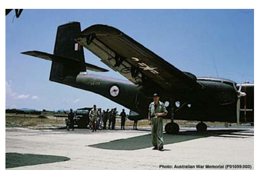
Sqn Ldr Doug Harvey back at Vung Tau Note US starboard wing markings